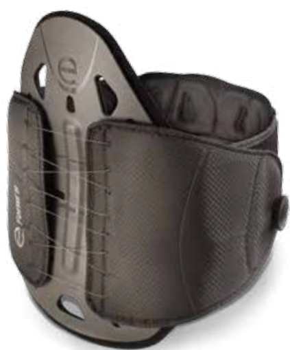
Exos FORM™ II 637