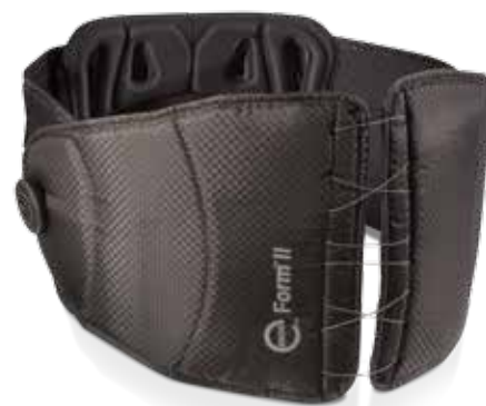
Exos FORM™ II 627