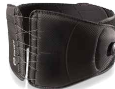
Exos FORM™ II 626