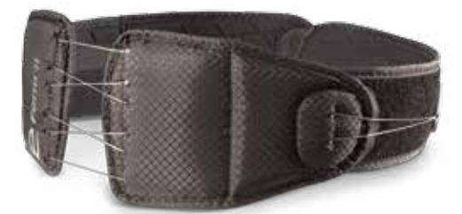
Exos FORM™ II 621