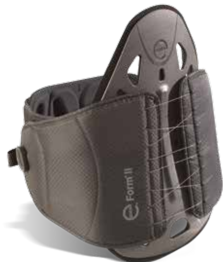
Exos FORM™ II 631