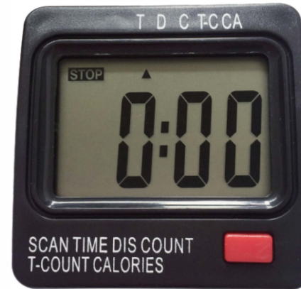
Display shows TIME