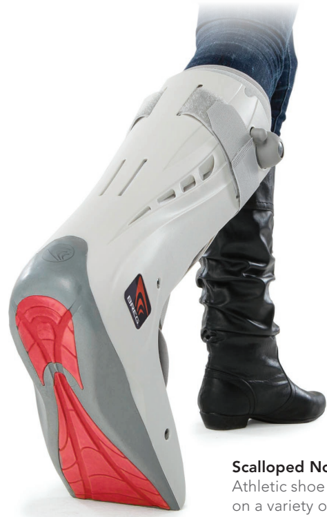
Scalloped No-Slip Tread Athletic shoe tread design provides traction on a variety of surfaces permitting better cross-directional maneuverability.