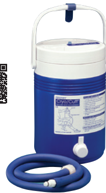
Cryo/Cuff™ Gravity Cooler