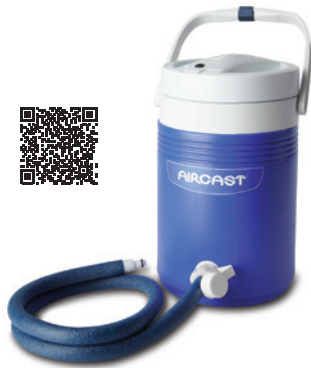
Cryo/Cuff™ IC Cooler