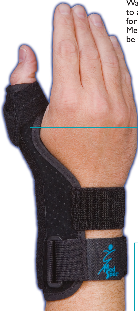
Short Suede Thumb Support

The inner elastic strap and the outer closure strap work in concert to allow for an easy and secure closure around the thumb.