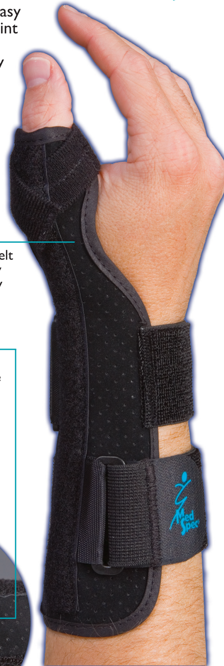
Long Suede Thumb Support